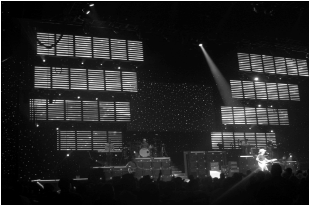
Versa® Tubes & Vari*Lite® on Brad Paisley Tour

All products named are trademarks of the manufacturers listed.