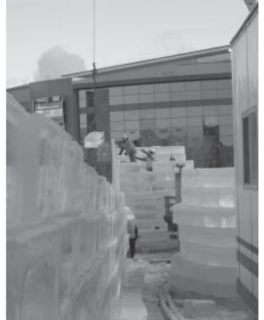
Builders with flame throwers construct one of the Ice Palace walls - above . Below - Construction site of the 2004 Ice Palace