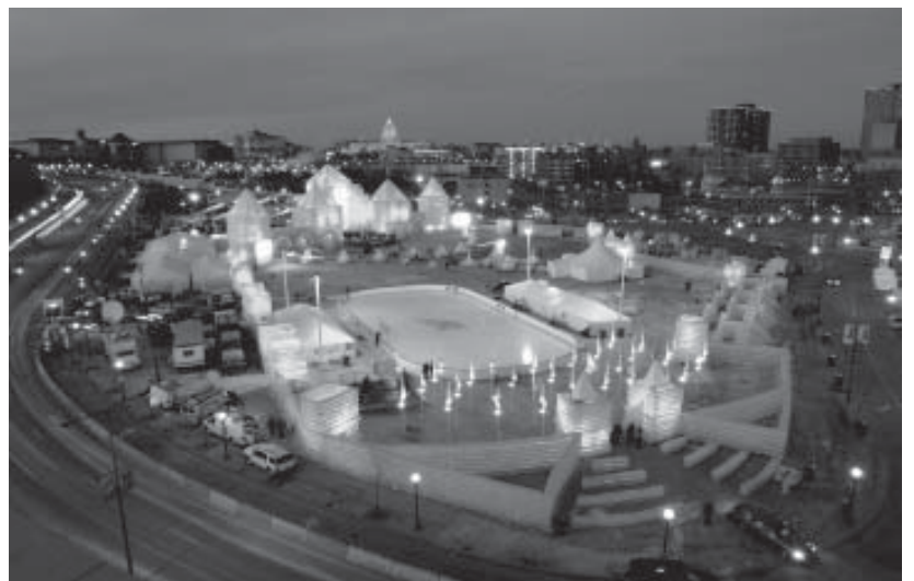
Aerial view of the 5-acre Saint Paul Winter Carnival Ice Palace grounds.

To see more pictures of the Ice Palace, visit our website, www.tlsinc.com .